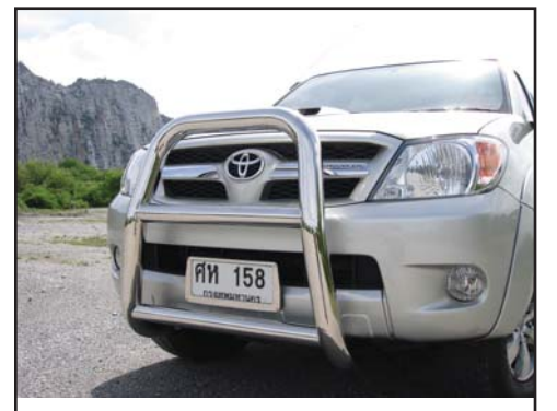
MODEL: 405V 3 Inches, Stainless Steel