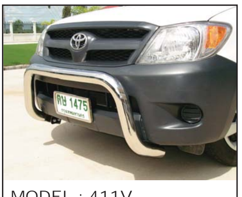
MODEL : 411V 3 Inches, Stainless Steel