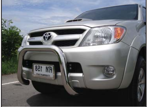
MODEL: 408V 3 Inches, Stainless Steel