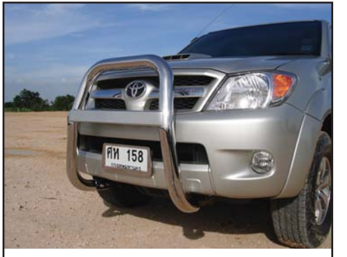
MODEL : 406V 3 Inches, Stainless Steel