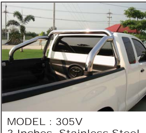
3 Inches, Stainless Steel

All front bumpers and roll-bar are made by high performance CNC bending machine to define perfection on every curve without wrinkles or ripples. Only premium T304 grade stainless steel is prefered material for making front bumper and roll-bar at our company. Then, all tubular bent is buffed until mirror by hand for perfect touch. Furhter, all brackets for front bumper and roll-bar are laser cut for more precision on fitting. All stainless steel products are 3 year warrantee rust proof. View warrantee terms for more information. Or visit www.giantoffroad.com